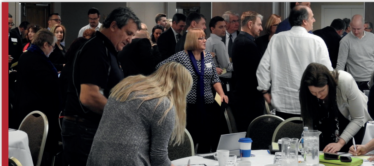
Perth Consultations, 18 August 2017

Additionally, government project requirements for apprentices/trainees could be strengthened by mandating specific ratios and ensuring rigorous compliance to verify employers are employing apprentices and trainees. Under the Government's Plan for Jobs , the Department of Training and Workforce Development's Priority Start policy is currently being expanded and will have stronger compliance requirements.