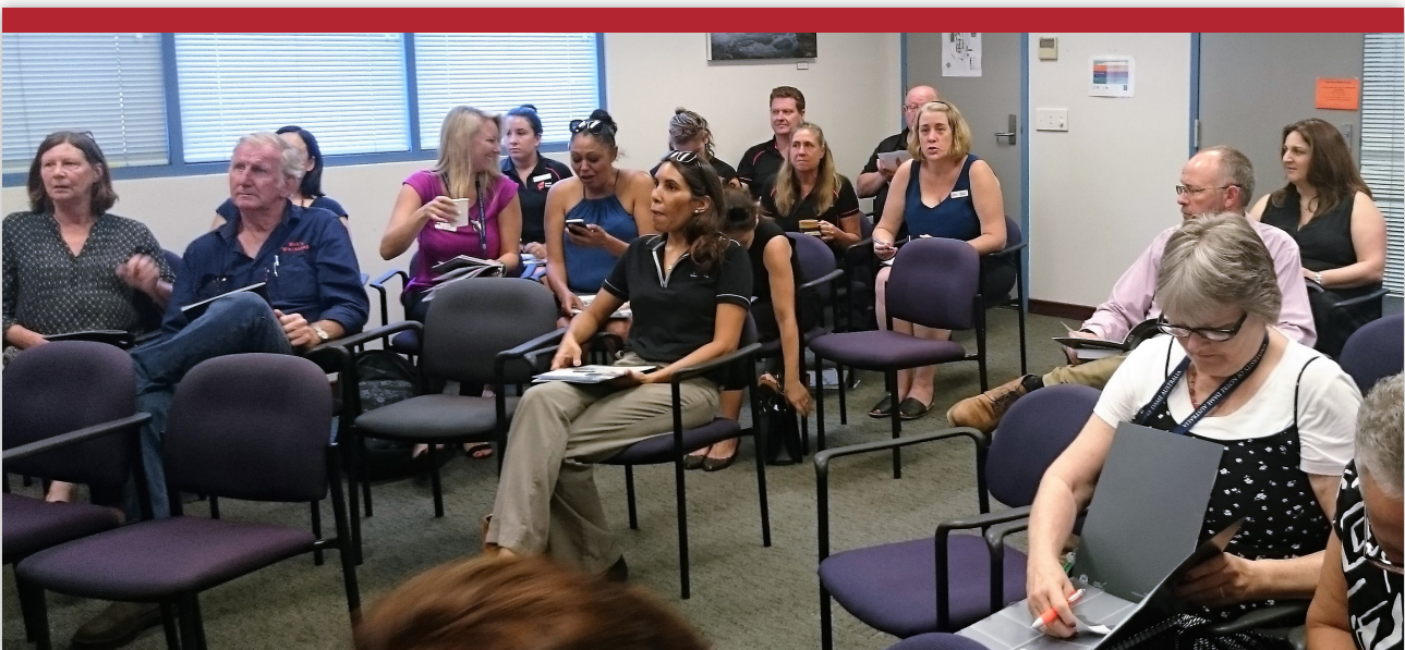
Broome consultations, 13 November 2017